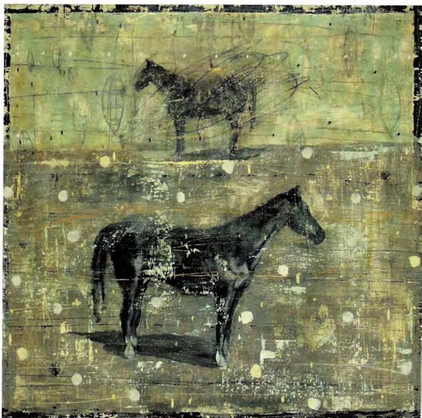
Motion in Stillness

Oil, Alkyd & Pencil on Canvas | 35 x 29 inches | 2009