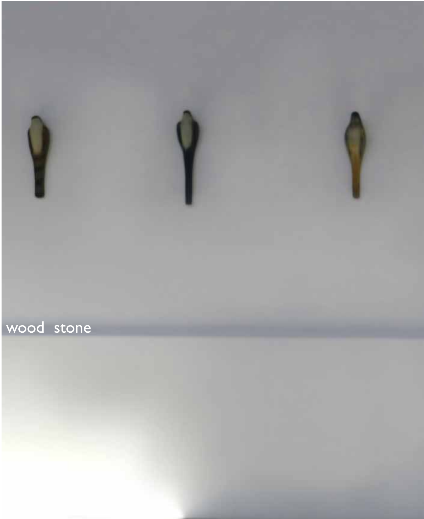
glass wood stone